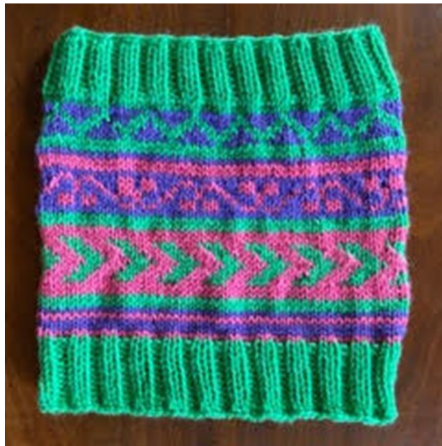
“Going Green Colorful Cowl” Knit, stranded colorwork Acrylic